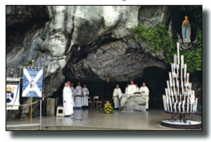
25 thousand people and it was full, to be part of such a congregation celebrating Mass was an uplifting experience.

Cardinal O'Brien was the main Celebrant at the International Mass. The underground Basilica holds