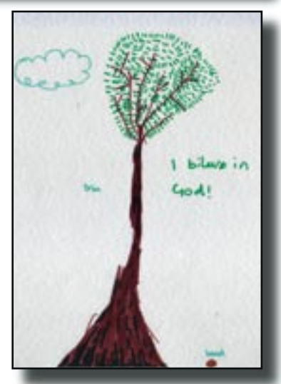
A grateful word of thanks to our sponsor